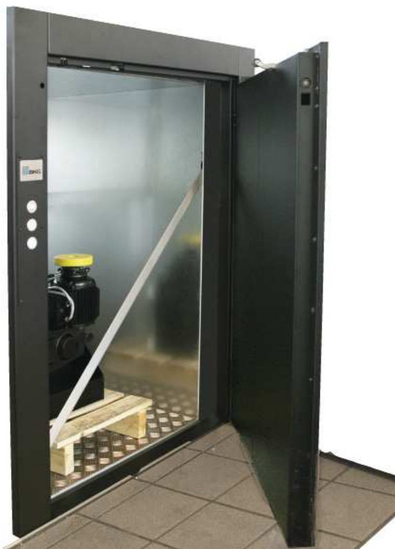
Hinged door with drop bar